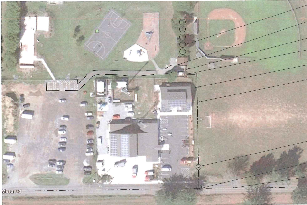
1 CIVIL SITE LAYOUT