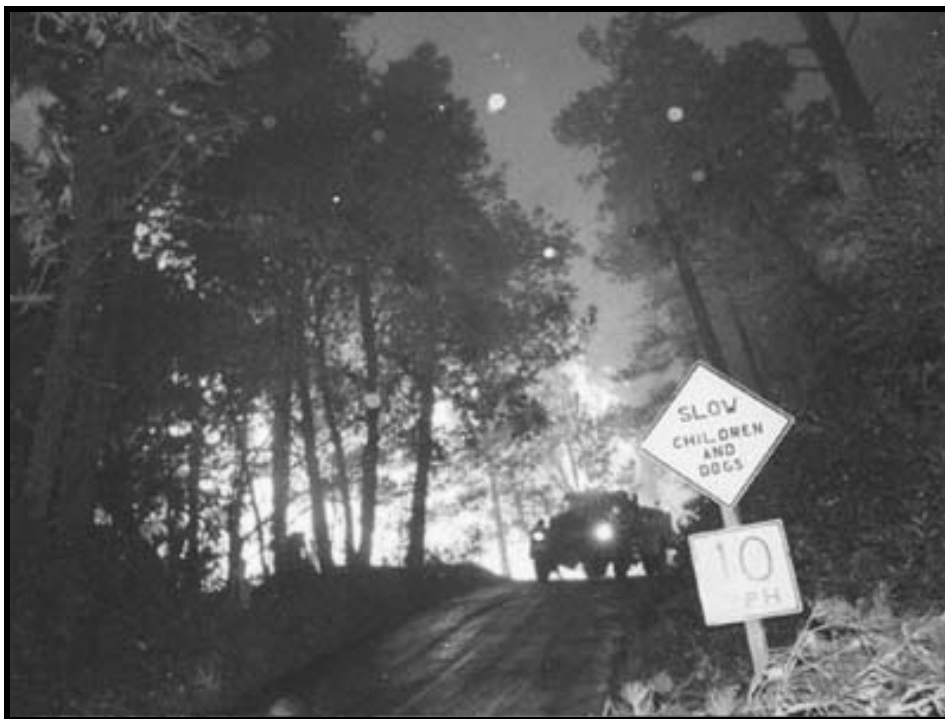
Mount Vision Fire, PRNS 1995

Mesa where the rights-of-way are literally subsumed with vegetation; she said that this vegetation must be cleared a sufficient distance back to allow for emergency ingress and egress and in the interest of public safety. Chief Tyrrell-Brown presented a prioritized map of the Mesa for the BCPUD Board to review, which identifies the specific roads that are an immediate priority for egress purposes; the goal is that residents will have no more than one block to travel before accessing an egress road that has been sufficiently cleared of encroaching vegetation. Chief Tyrrell-Brown emphasized that she does not seek to implement a “road improvement” project -- she is not asking to widen or improve the existing roads, but rather simply to clear encroaching vegetation so that the rights-of-way could be accessible via both fire engines and residents’ vehicles in the event of a wildfire.