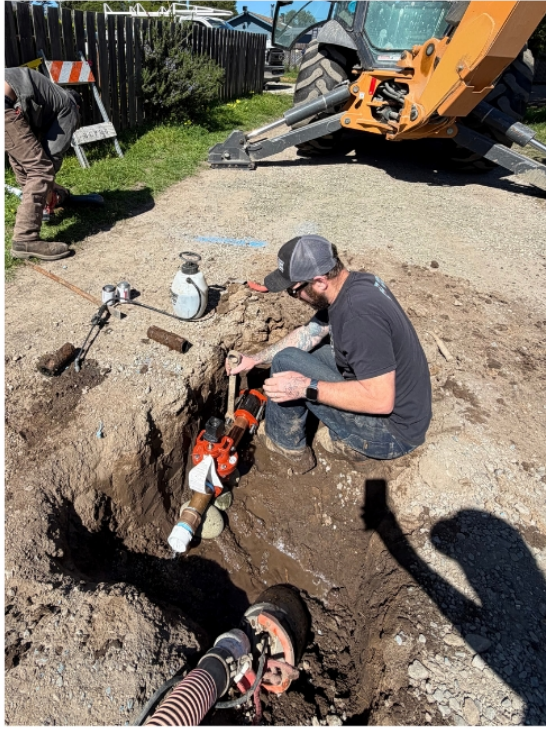
BCPUD Staff Performing Leak Repair